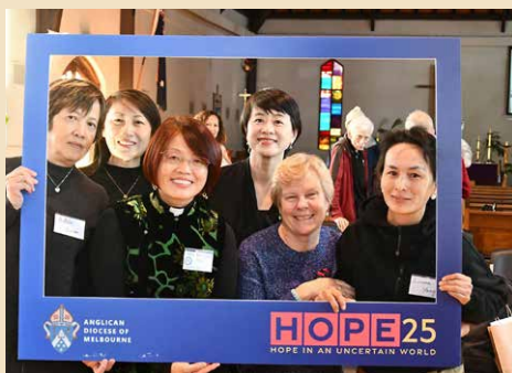
Chinese Culture and Christian event, St David's Moorabbin