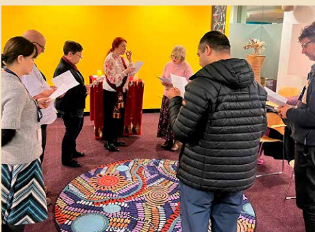
Royal Melbourne Hospital sacred space of worship and outreach for staff and patients