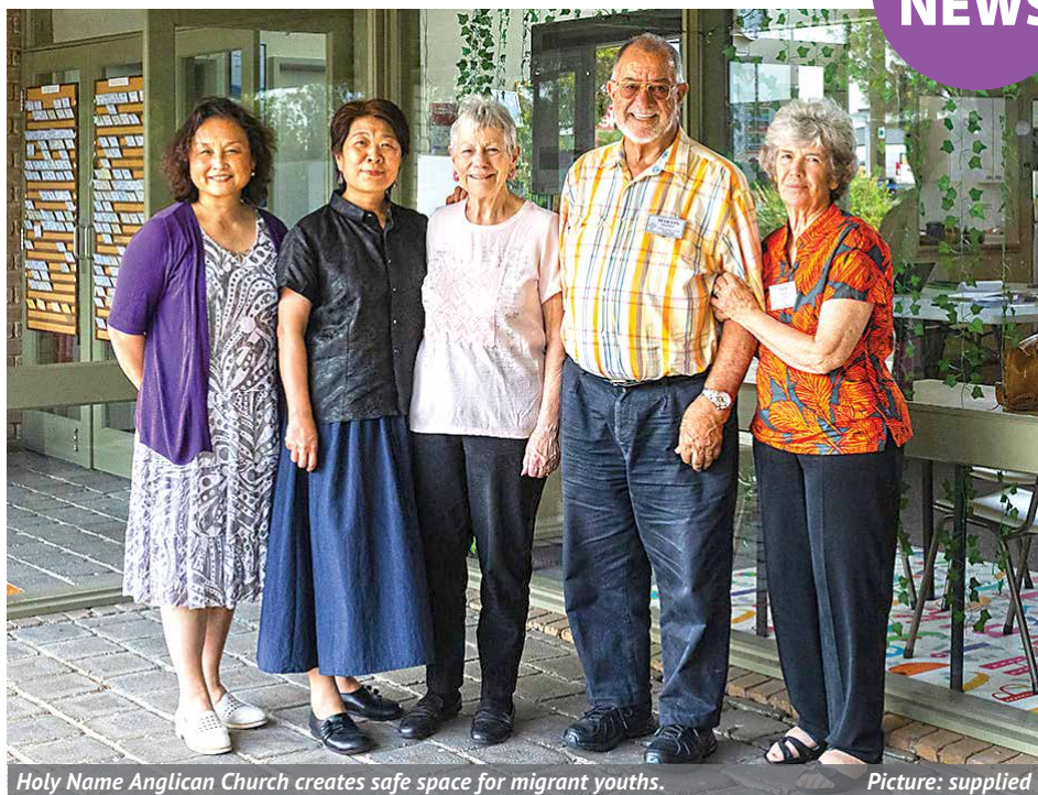
Holy Name Anglican Church creates safe space for migrant youths.