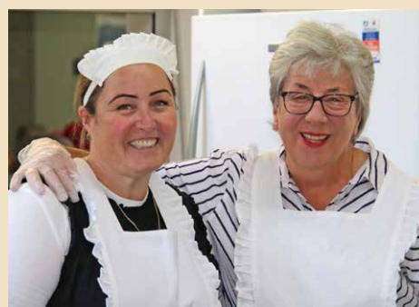
High Tea event, Holy Trinity, Lara with Christ Church Little River