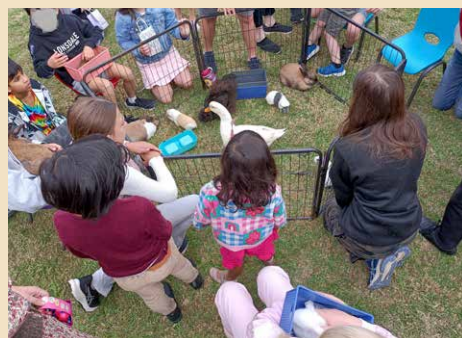
Picnic event, Hills Anglican Community

Here's our exciting news as to what is coming up!