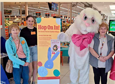
Lilydale Easter Craft volunteers, Lilydale Anglican Parish