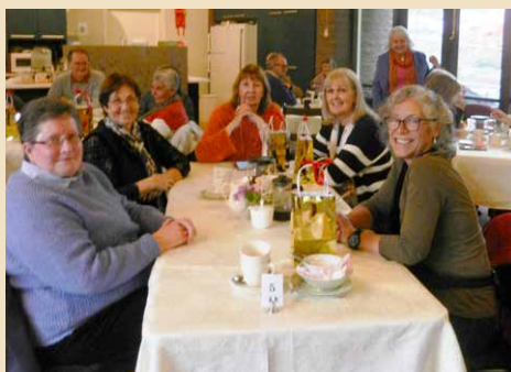
Divine Devonshire Tea event, Anglican Parish of Mount Dandenong

In 2024 there were 31 expression of interest, 20 grants awarded and a total of $6,300 distributed.