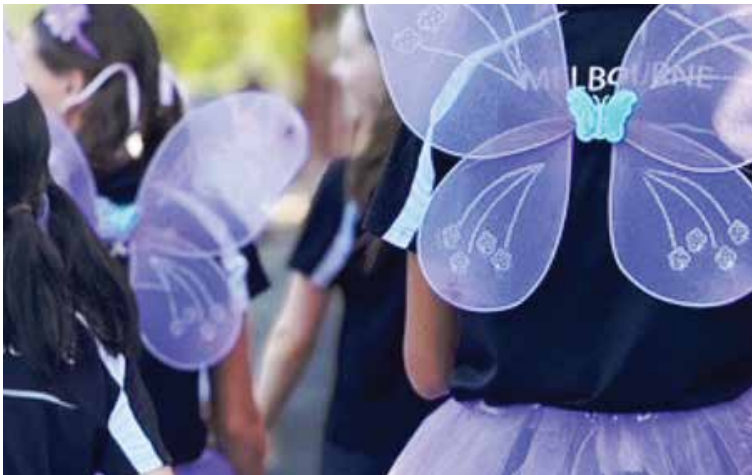
The sea of colourful tutus walking around the Botanical Gardens as a part of a 2025 Youth4Youth walkathon with Melbourne Girls Grammar School.