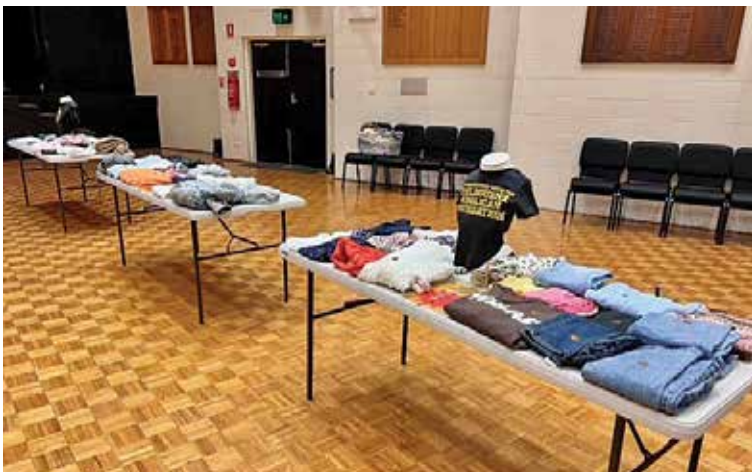
Melbourne Girls Grammar School students ran a pop-up op shop where each girl contributed a treasured item to support young people in need.

After an incredible inaugural year of School Engagement with Melbourne Girls Grammar School in 2025, we look forward to building on our program, expanding our reach with new schools, and continuing our partnership with MGGS.